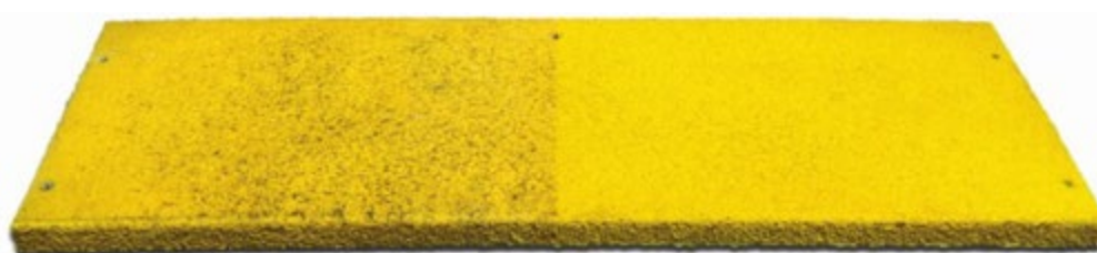
Example showing before and after high pressure cleaning

CAUTION: Do not use mops. The gritted surface will catch and retain fibres. Strong solvents are likewise not recommended.